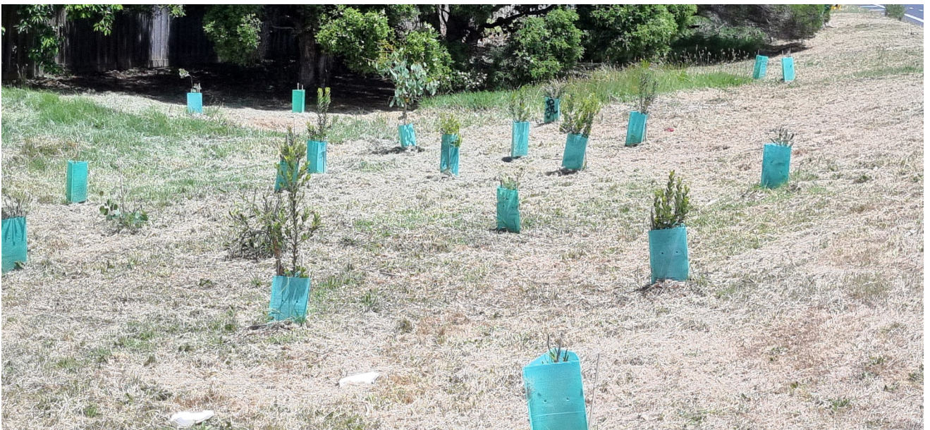
Some of our Banksia trees thriving beside the Frankston Freeway.