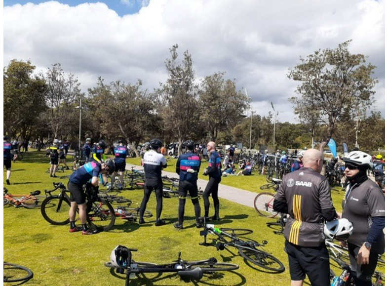
Riders at the Frankston rest area or was that exhaustion area !!