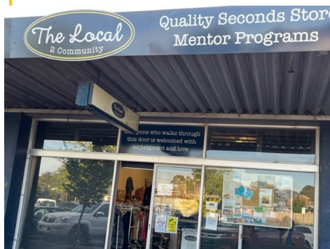
Leanne explained the workings of Local2 Community

They have 25 Volunteers but need more especially males to help with the work. The gardens in the back paved area are looking great thanks to an eager volunteer who keeps them watered. Leanne thanked FNR for the work we have completed. Thank you to all the volunteers who support this area of Frankston North through Local 2 Community.