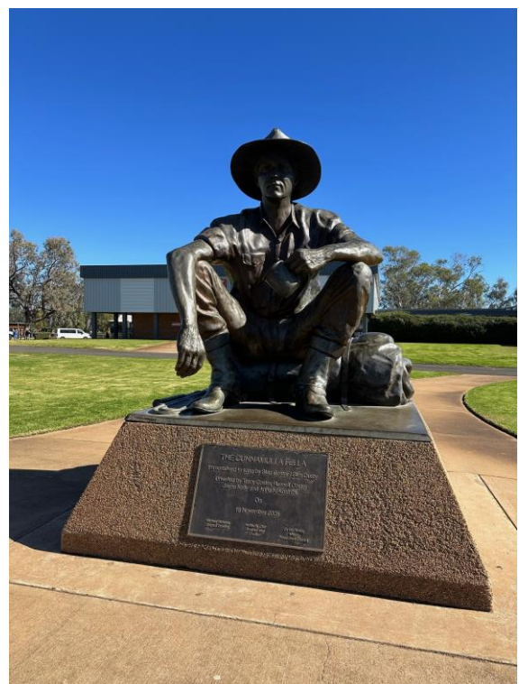
The Kunnamulla Fella