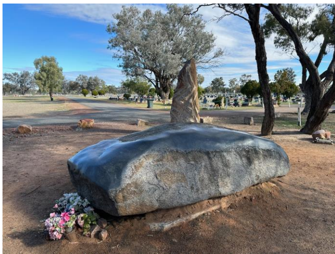
Fred Hollows Grave