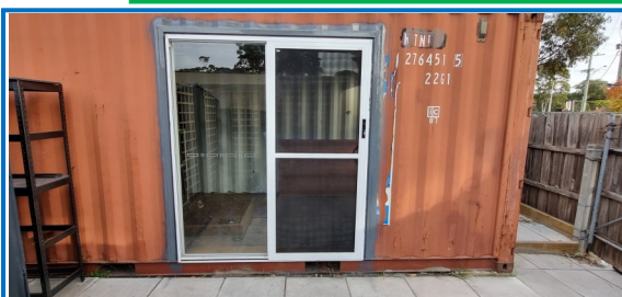
The new door installed in the container at the Local2Community site. The container is looking good after the surgery