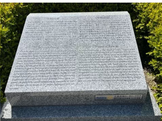
David relaxing beside the Rotary plaque in Hiroshima Peace Park