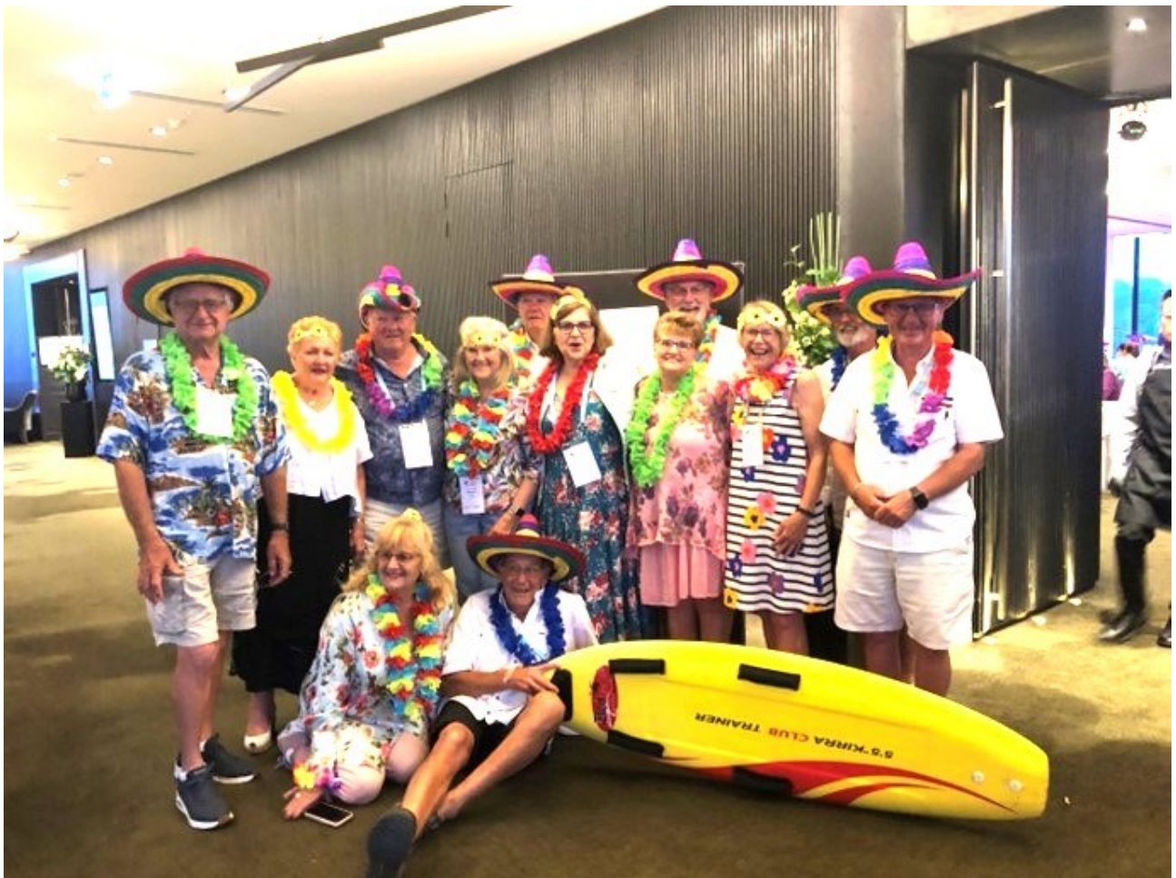
The Frankston North contingent embracing the Beach Party theme of the Saturday Night Dinner