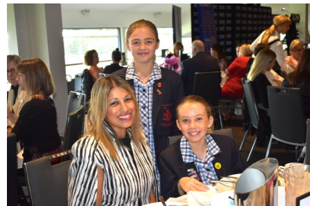
Women of all ages