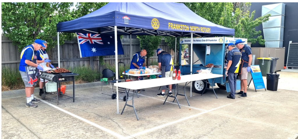
Preparing for the onslaught of hungry campers