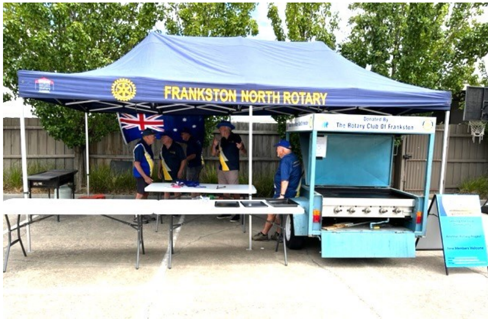
Setting up the sausage sizzle site

The young people were most appreciative of our support and the Camp Organisers have expressed their thanks to us all. Thank you to the FNR team for your support.