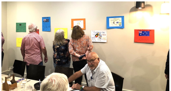
Club members examining the posters made by our grandchildren to commemorate Australia Day