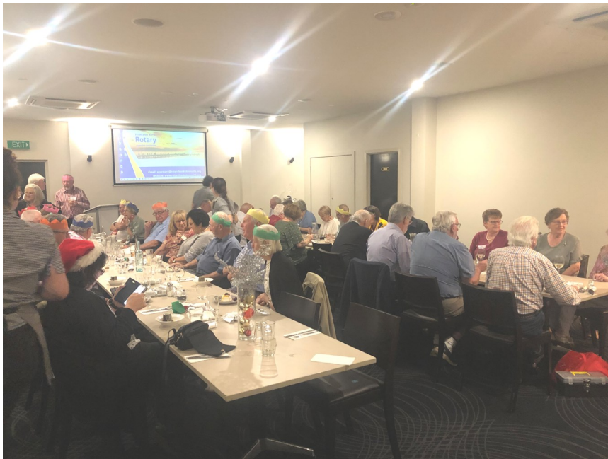
Rotarians, Partners and Guests enjoying a great Christmas dinner during the Club's Christmas function

A reminder that registrations for the District Conference at Cape Schanck on 24-26 February. You can register on-line. Details are contained in the flyer later in the bulletin. We are planning fellowship events for our Club members at our Conference accommodation. Register for the Conference to support our District and enjoy a traditional Frankston North great fellowship weekend.