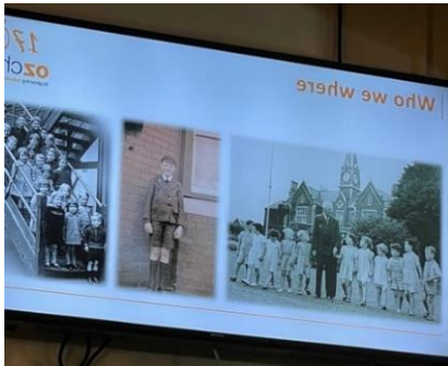
OZ Child-The Early Days