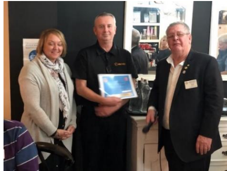
Presentation of a certificate of appreciation