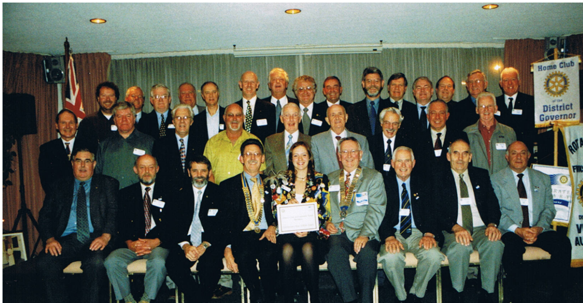
Members of the Rotary Club of Frankston North: Centenary Year of Rotary 2004/05

District 9820: The club was required to assist the District Governor in the discharge of district administration and had the task of organising and conducting the Annual District Conference.