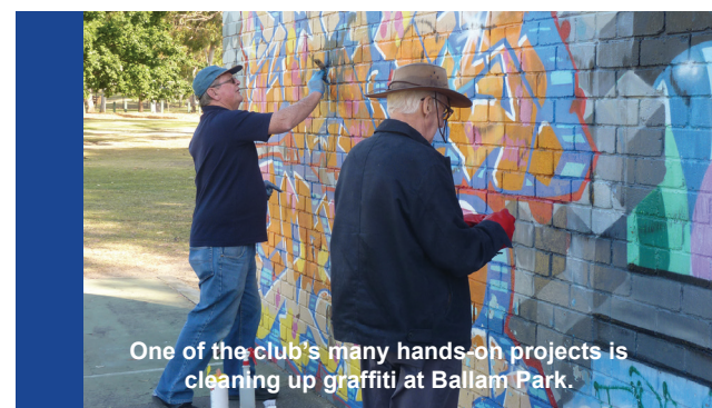
One of the club's many hands-on projects is cleaning up graffiti at Ballam Park.

One of the many hands-on projects that Frankston North Rotary undertakes is maintenance works at Ballam Park. The Rotunda bears the Frankston North Rotary sign to acknowledge the erection of the shelter.