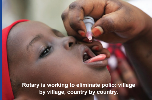
Rotary is working to eliminate polio: village by village, country by country.