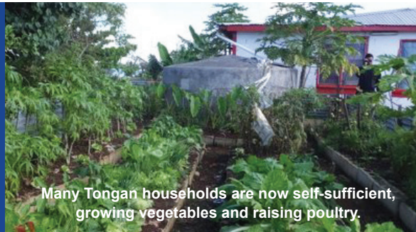
Many Tongan households are now self-sufficient, growing vegetables and raising poultry.

Donations In Kind is a major Rotary recycling operation that assesses, packages and sends materials to people in need. Frankston North Rotary, working with Peninsula Health, provides obsolete surgical equipment to poorly equipped third world countries.