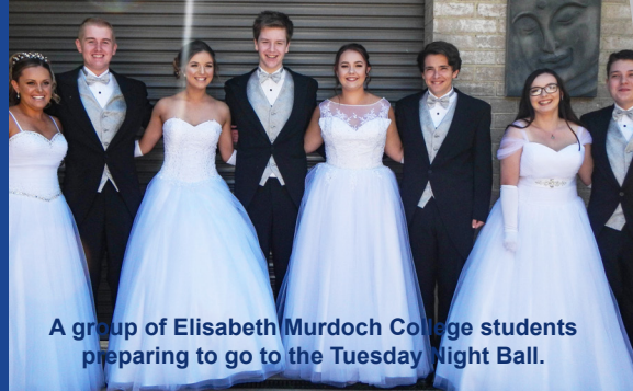
A group of Elisabeth Murdoch College students preparing to go to the Tuesday Night Ball.

In 2015, Frankston North Rotary chartered Monteract, a junior Rotary Club for 13 to 18 year-old-students from Monterey Secondary College. The students are dynamic, resourceful and have a great understanding of community service and giving back to their community.