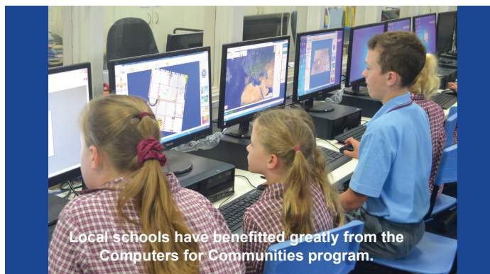
Local schools have benefitted greatly from the Computers for Communities program.

Frankston North Rotary has been running this program over the past few years. Data centres donate their replaced equipment and these computers are then allocated within the local Frankston North communities according to need.