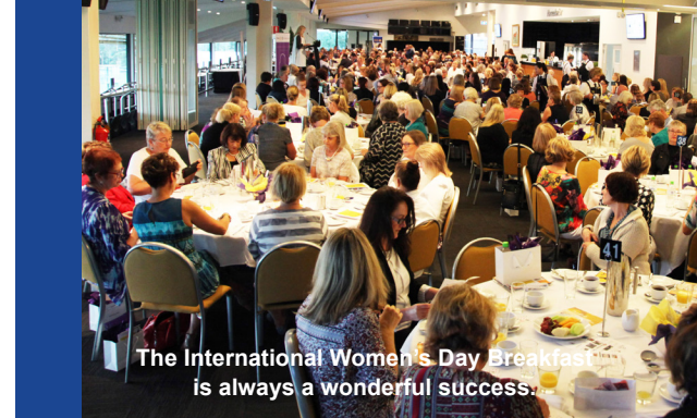
The International Women's Day Breakfast is always a wonderful success.